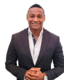
CVO & Founder FORT International