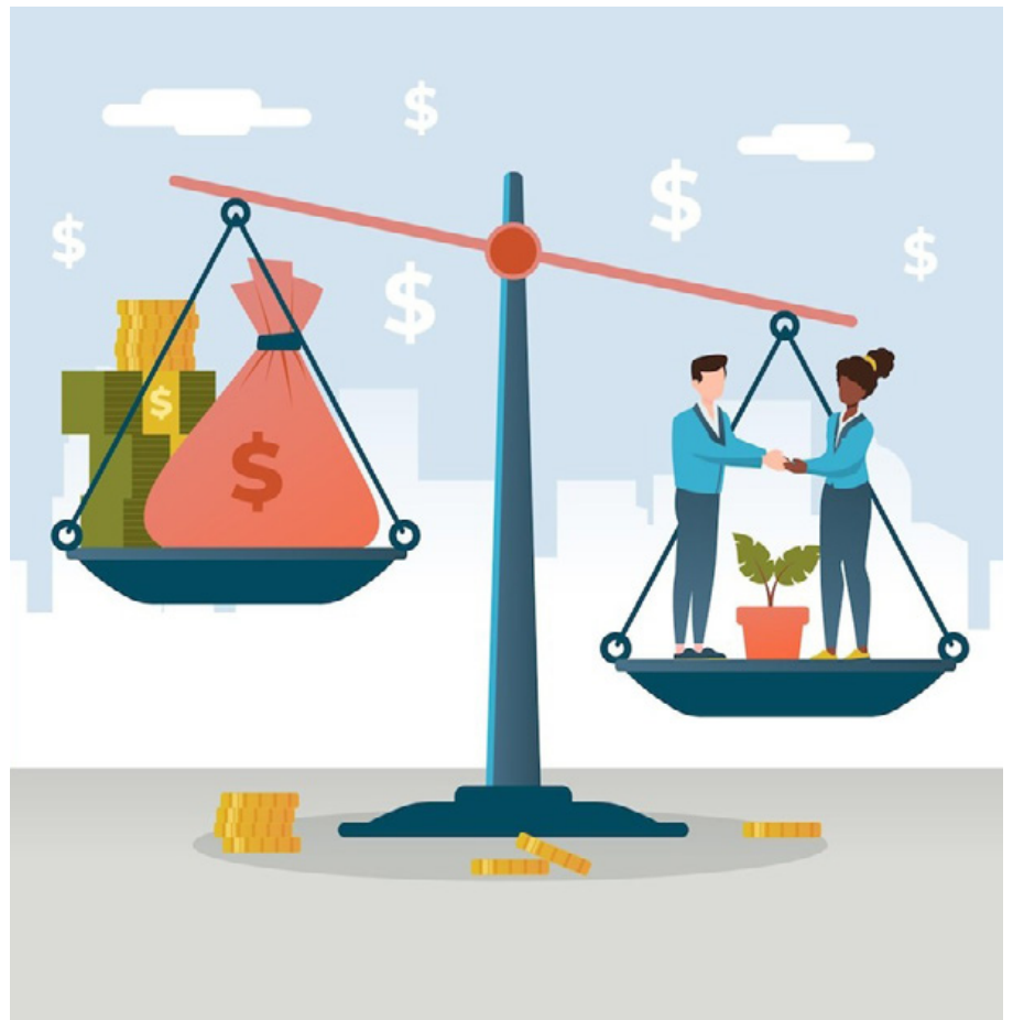
UNJUGGLED: Lessons From a Decade of Blending Business, Babies, Balance and Big Dreams

As the saying goes, "You can have anything you want in life, you just can't have everything". You will have to sacrifice some things in order to gain control of your time, but a balanced life shouldn't be collateral damage. Find things that are fulfilling and do so by utilizing your gifts and talents as part of your daily movements, this will boost your internal reward system and make you feel alive.