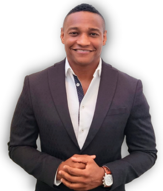
CVO & Founder FORT International