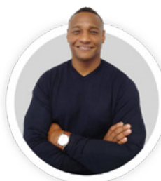
CVO & Founder FORT International

Enjoy the journey, for If we are not having fun... What are we doing?