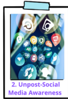
2. Unpost-Social Media Awareness