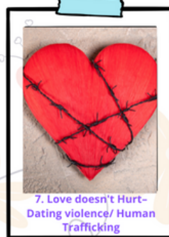
7. Love doesn't Hurt-Dating violence/ Human Trafficking