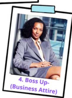
4. Boss Up- (Business Attire)