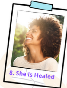
8. She is Healed