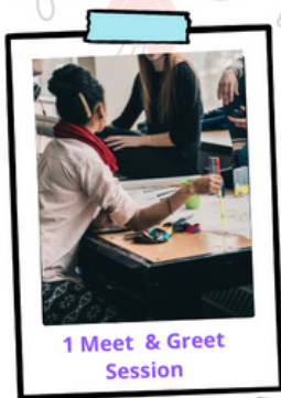
1 Meet & Greet Session