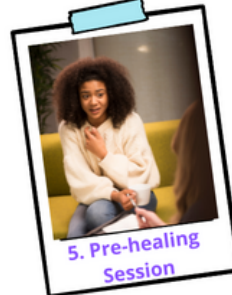
5. Pre-healing Session