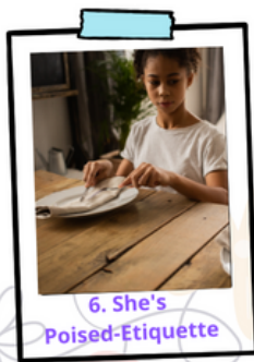
6. She's Poised-Etiquette