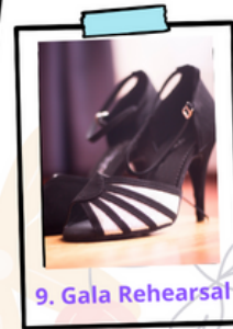
9. Gala Rehearsal

If you are interested in helping this organization contact them to request more information on how to support them by becoming a sponsor, volunteering with them, providing donations, or other resources.