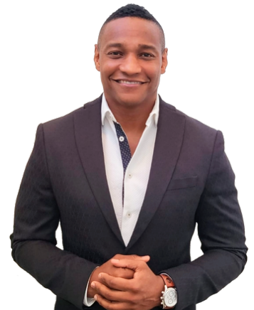
CVO & Founder FORT International

All of our material accomplishments will stay behind for someone else to enjoy, so the allocation of time to mindful work and communication is truly the legacy we leave behind. Begin the change today, as nothing changes if change doesn't begin with you.