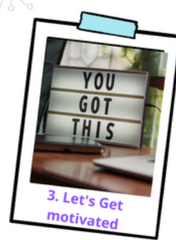
3. Let's Get motivated